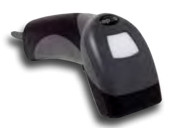
Bar Code Scanning

Up to four RS-232C communication ports hidden behind a convenient, easy to access door located on the back of the unit.