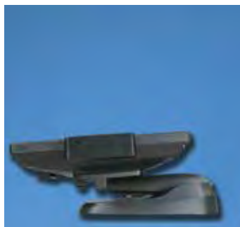
Double Articulating Terminal Folds Flat