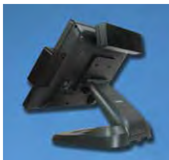
Optional Integrated VFD Customer Display