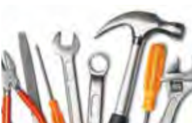
Hardware, Paint or General Retail Stores