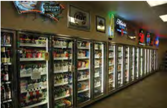
Beer / Liquor Stores