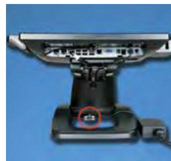
Cable Management Keeps Cords Hidden and Organized (RJ48-DB9M Adaptor Included)