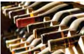
Tobacco / Wine / Small Grocery Stores