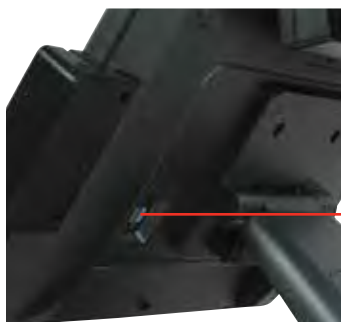
Two USB Ports Located on the Back of the Unit