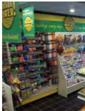
Convenience Stores / Dollar Stores / Gift Shops