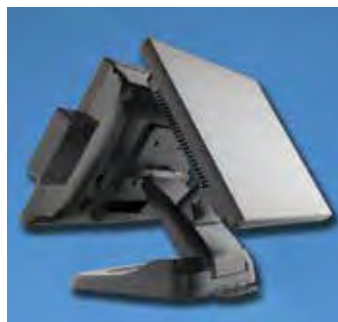
Optional Integrated 15" Rear LCD Customer Display (Reflection POS for Windows)